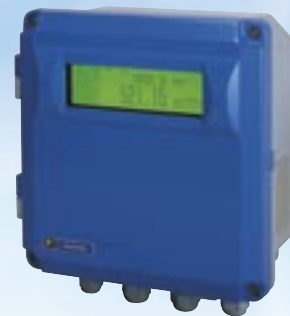
Flow Transmitter (Model:FSH)